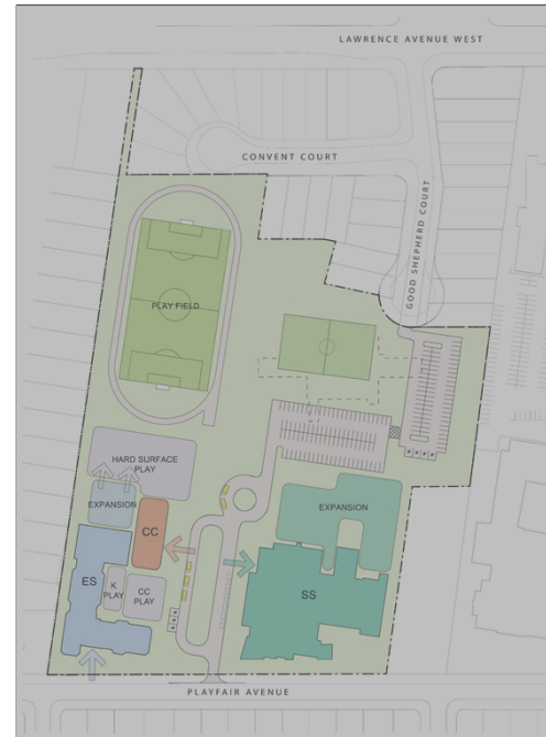
Option 3 Additions and alterations to both Regina Mundi and Dante