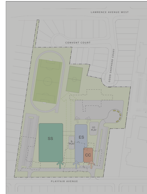
Option 4 Replace (build new) both Regina Mundi and Dante