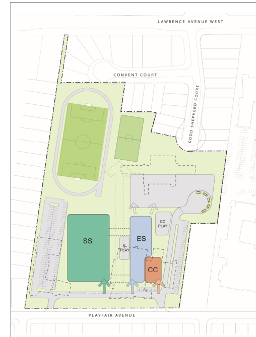
Option 4 Replace (build new) both Regina Mundi and Dante