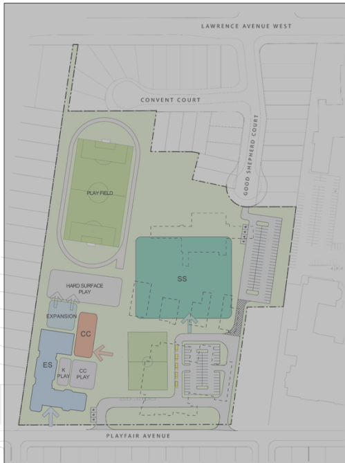
Option 1 Retain Regina Mundi, with additions and alterations, build new Dante