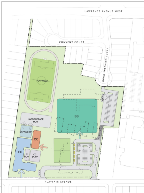
Option 1 Retain Regina Mundi, with additions and alterations, build new Dante