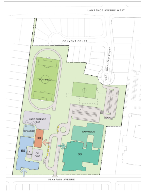
Option 3 Additions and alterations to both Regina Mundi and Dante