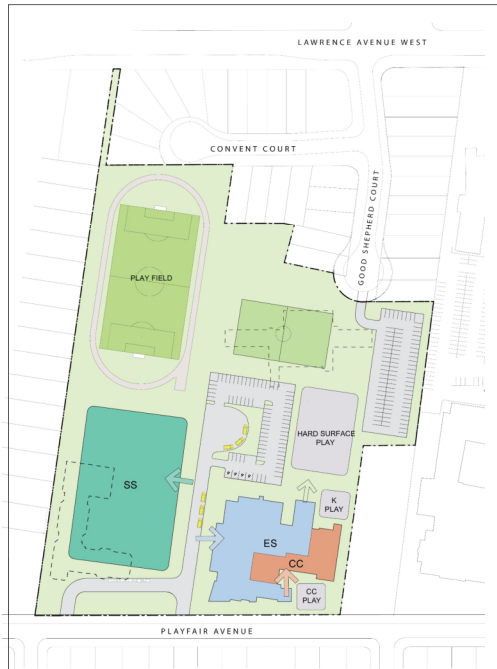
Option 2 Retain Dante, renovate for RM, and build new Dante