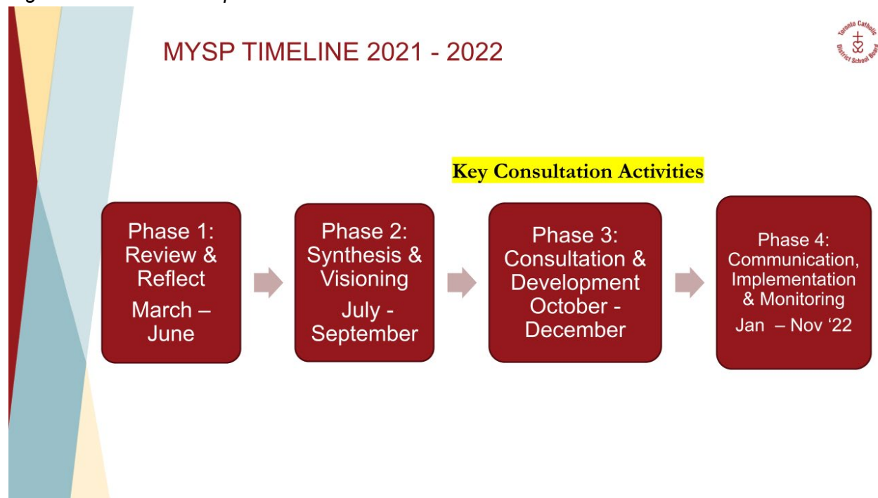
Figure 1: MYSP Development Timeline

This document presents the consultation plan and recommended activities to take place in the fall of 2021, along with suggested roles and responsibilities. It was created by Maximum City in consultation with staff, and is informed by the Board's Community Engagement Policy. As noted in the policy, effective consultation of stakeholders aligns with multiple priorities in the current MYSP, including Strengthening Public Confidence and Fostering Student Achievement and Well-being. A strong community engagement program for the new MYSP will build relationships and a sense of belonging and purpose among participants, while respecting their right to be involved in Board decisions and policy direction.