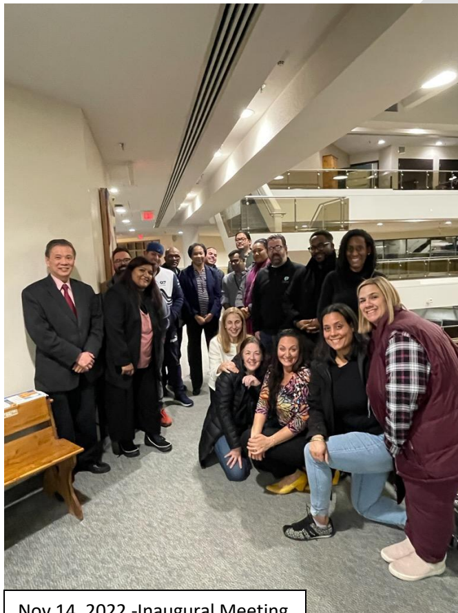
Nov 14, 2022 -Inaugural Meeting