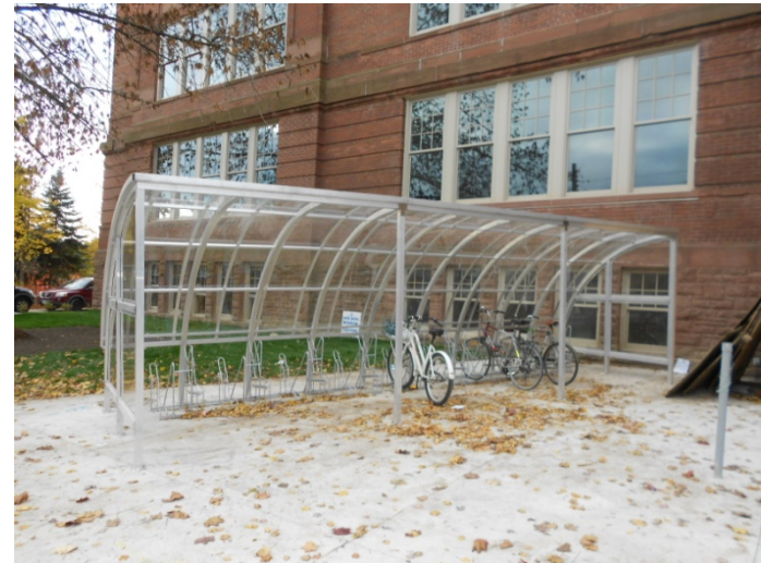
Artscape / Givins-Shaw Junior Public School